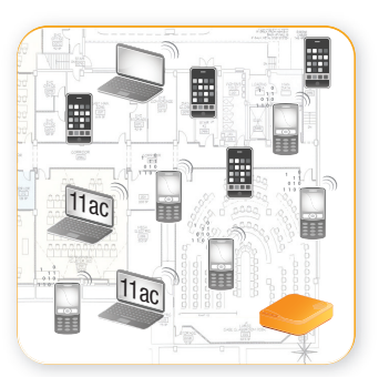
Ultra High User Density