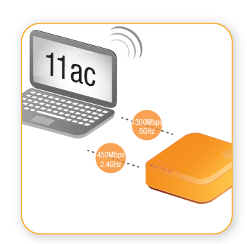
Blinding Fast 3-Stream 802.11ac